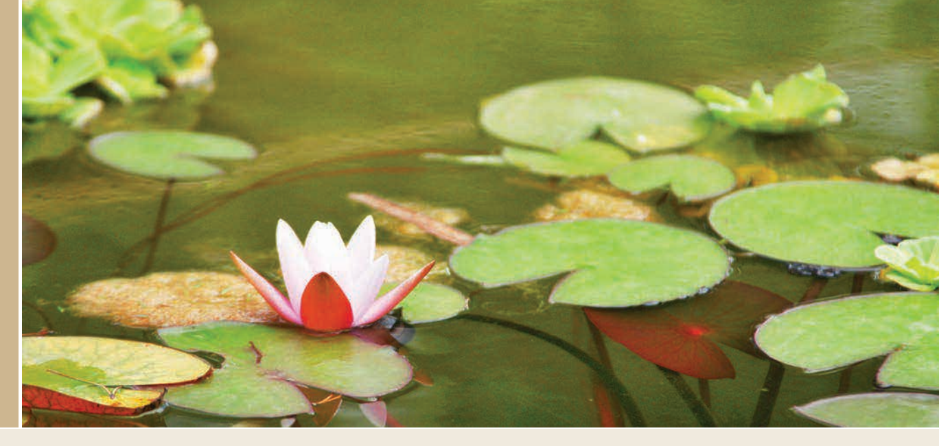
At Altenheim - PLANT THE SEED . . .